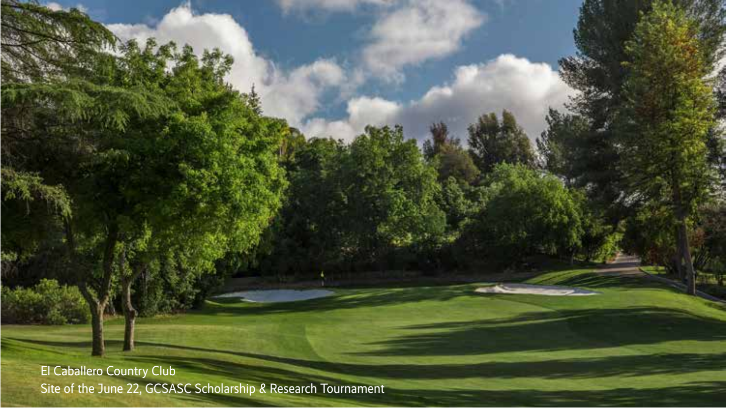
El Caballero Country Club Site of the June 22, GCSASC Scholarship & Research Tournament