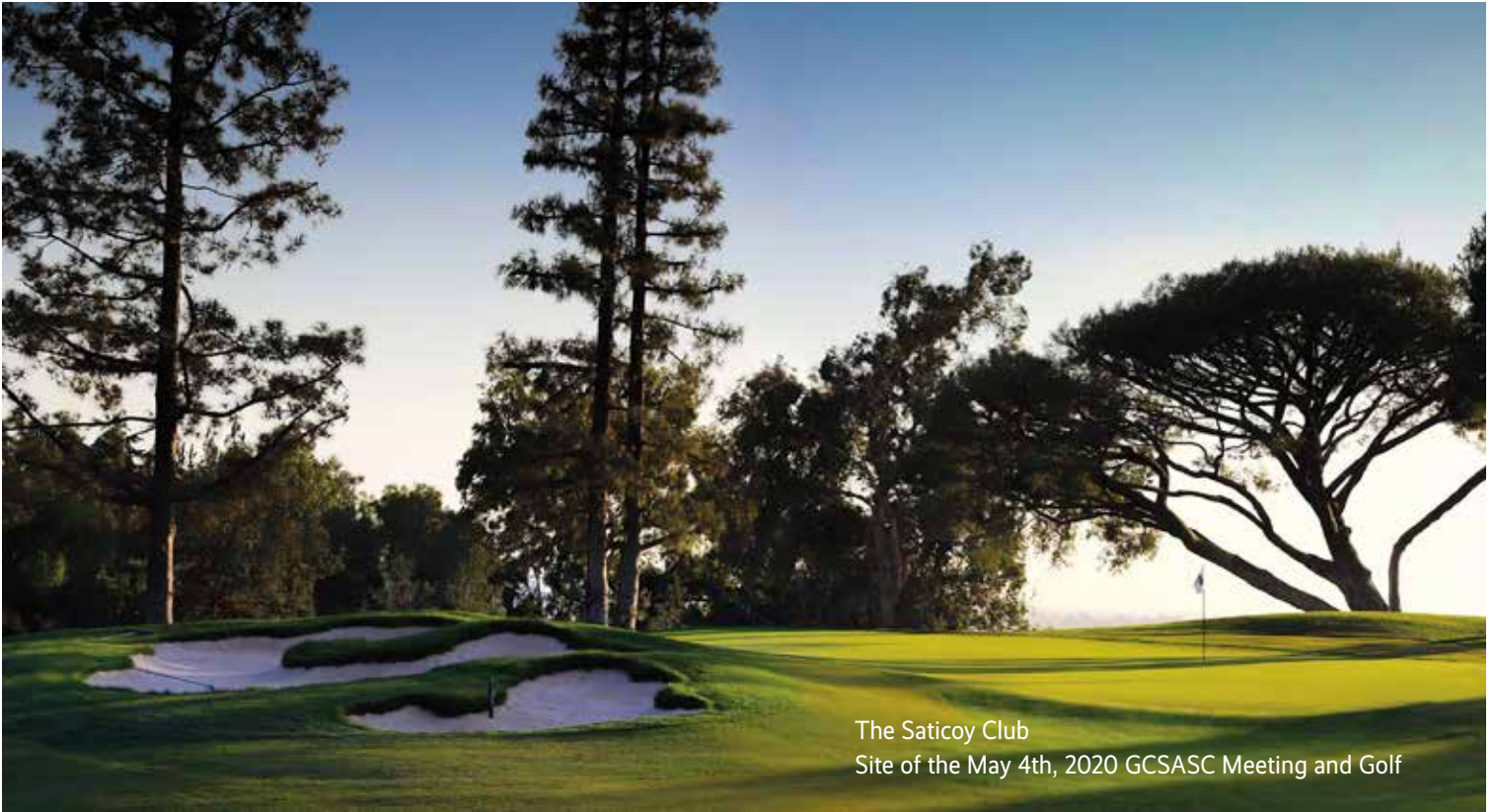
The Saticoy Club Site of the May 4th, 2020 GCSASC Meeting and Golf